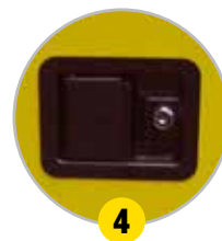
4 Integrated locking handle