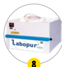
8 Recirculating air box