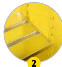
2 Adjustable shelves