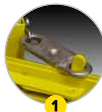
1 Thermo-fuse closing (based on model)