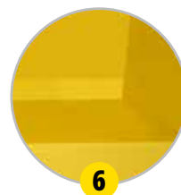
6 Liquid tight containment sump