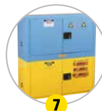
7 Stacking cabinets