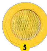
5 Vent with built-in flame arresters