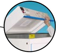
Active charcoal filter