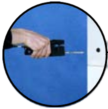
Sampling port test of the filter saturation