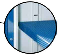
Perforated shelves adjustable in height