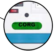
Control window for filter presence