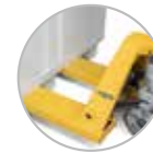
Moving by pallet truck (empty)