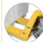
Moving by pallet truck (empty)