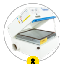
8 Recirculating air box