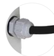
Cable management PEXTBALI14 (option included with PRISELI14)