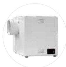
Ventilation box CDV-A (option)