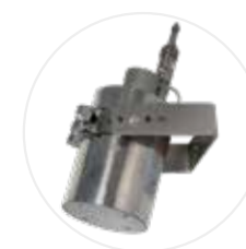
Fire extinguisher EX100LI/EX200LI (option)