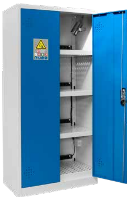
▲ AZ301BLI + 4 PRISELI14 + EX200LI + PEXTBALI14

Fume hoods, filtering cabinets - Ventilation Lithium-ion cabinets Flammable cabinets Corrosive cabinets Toxic cabinets and Multirisk Containment and cans File cabinets Anti-fire equipments Showers and first-aid equipments