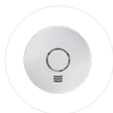
ALARMWI connected smoke detector (option)