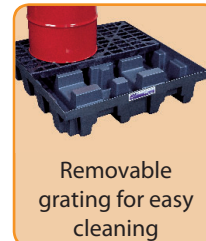
Removable grating for easy cleaning