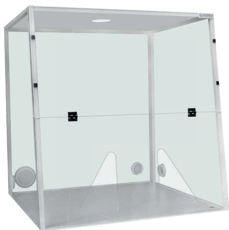
▲ BH09D+ + BB09